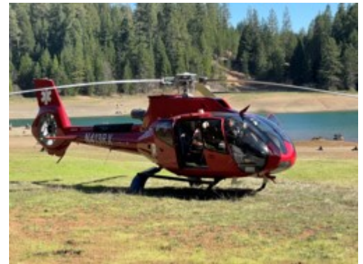
REACH 5 helicopter ready to transport with injured outdoorsman on board.