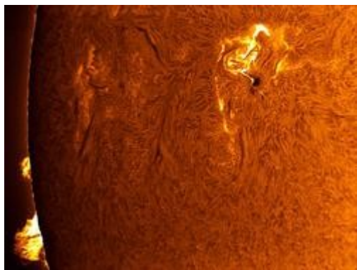
This Solar Dynamics Observatory Image was taken on April 27, 2022.

Tad Cook, K7RA, Seattle, Washington, reports: