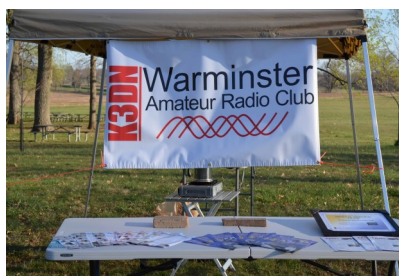
Club Welcome table with Club Banner and Amateur Radio Literature

A number of park visitors stopped by to find out what we were doing, including some active and inactive Ham's who were enjoying the beautiful spring day. We had on site literature available about Amateur Radio that we obtained from the ARRL. The event was a success in all aspects, enjoyed by all who attended.