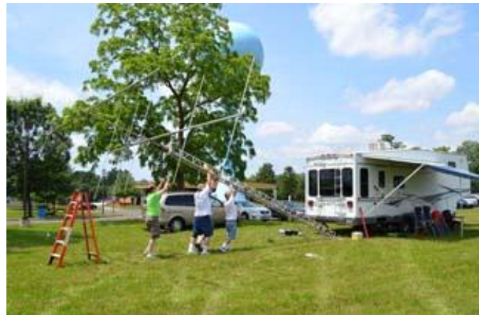
Launching the 2M and 6M Beams