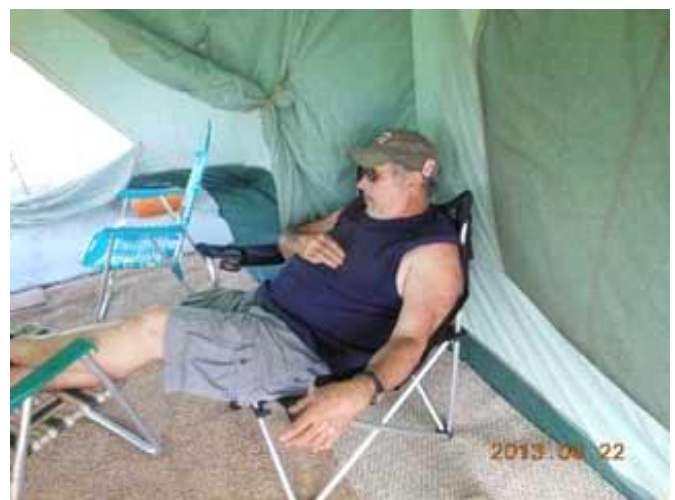
WJ3O Toughing It Out on 40M