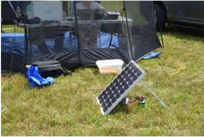
Solar Station with a KX3