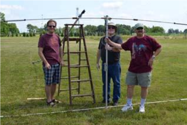
20M Team Building a Mosley Beam