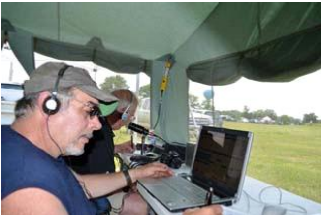
Logging a 40M QSO