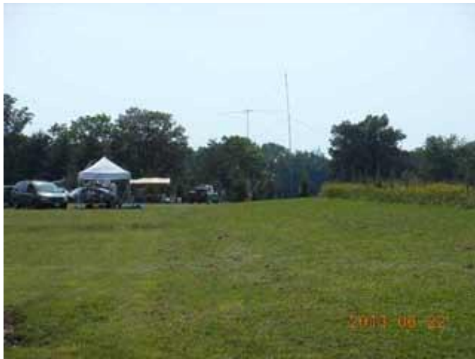
10, 80 and 20M Station