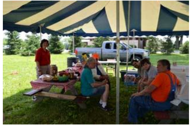
Relaxing During the Contest